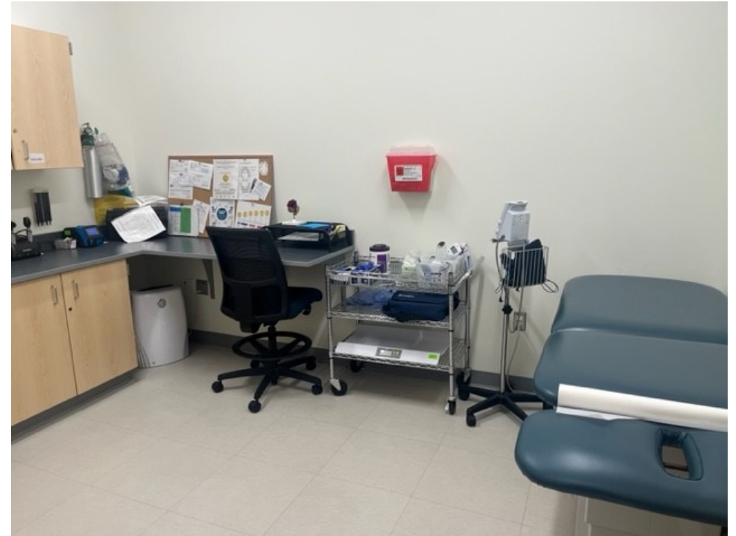
School Based Health Center Exam Room at GES